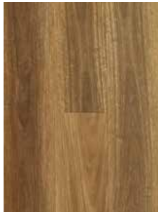
• Spotted Gum