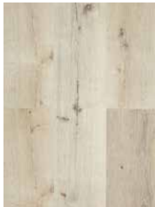
✓ Coney Island