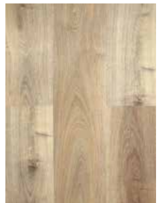
✓ Staten Island