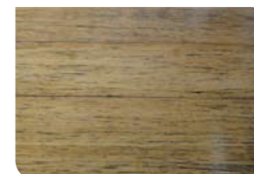
Craftwood Brushed Surface